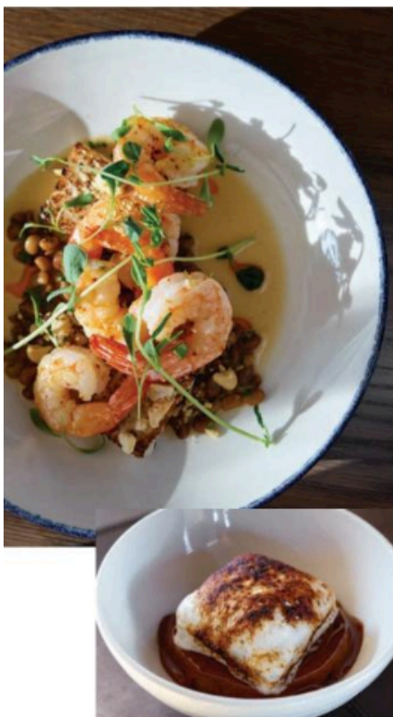
top to bottom Shrimp and grits with Georgia white shrimp and peanut miso broth. The s'more dessert is an elevated take on a classic indulgence.

FEATURING VERDANT VIEWS of Chastain Park, inventive sips and reimagined comfort food, The Chastain—headed by executive chef and operating partner Christopher Grossman—is a bustling café by day and a sophisticated New American restaurant by night.