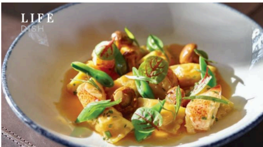
left Lobster agnolotti with chanterelles and sugar snap peas. below The Chastain's floor-to-ceiling windows bring the outdoors inside.